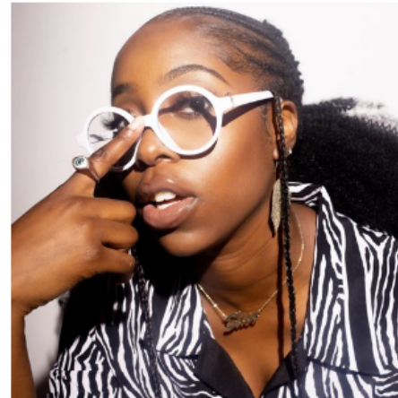
O-Slice, Writer and Performer

CONTENT TRANSPARENCY: THIS PRODUCTION CONTAINS MATURE LANGUAGE, INCLUDING USE OF THE N-WORD