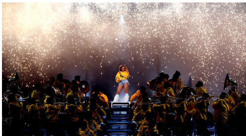
Beyonce at Coachella, 2018.