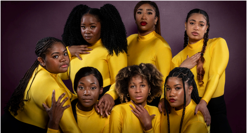
Pictured: The cast of THE SENSATIONAL SEA MINKETTES at Woolly Mammoth Theatre Company.

This play involves discussion and depiction of depression, suicidal ideation, and disordered eating. This play also includes profanity and sexual content. This production includes the use of haze, flashing lights, sudden loud noises, and items that fall onstage.