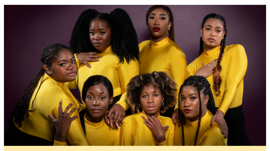
Pictured: The cast of THE SENSATIONAL SEA MINKETTES at Woolly Mammoth Theatre Company.

This play involves discussion and depiction of depression, suicidal ideation, and disordered eating. This play also includes profanity and sexual content. This production includes the use of haze, flashing lights, sudden loud noises, and items that fall onstage.