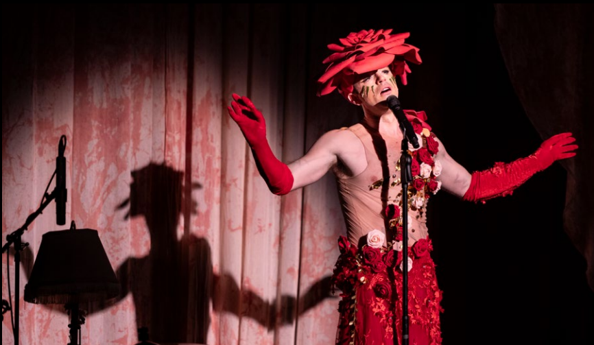
Rose: You Are What You Eat Copy