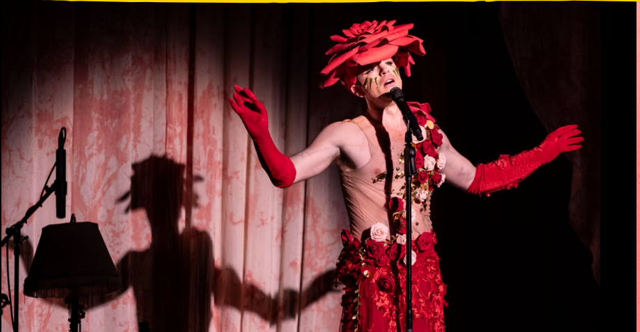
Rose: You Are What You Eat Copy