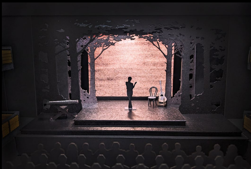
Dead Inside Scenic Design Model by Meghan Raham

To learn more about how to make a planned gift, please contact our Development Department by calling 202-312-5276 or email us at development@woollymammoth.net