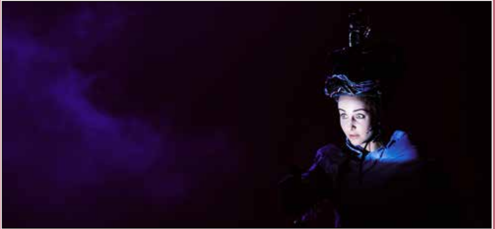
Ho ho ho ha ha ha ha