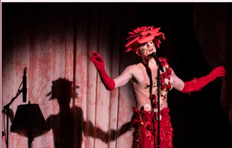
Rose: You Are Who You Eat